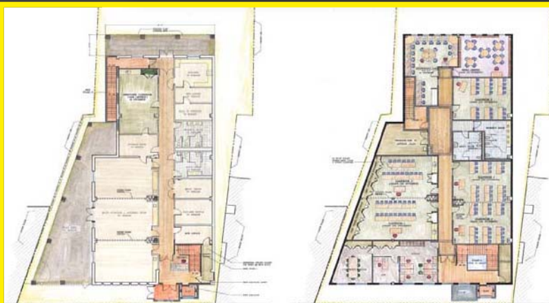
PROPOSED ALTERATION TO FIRST FLOOR PLAN