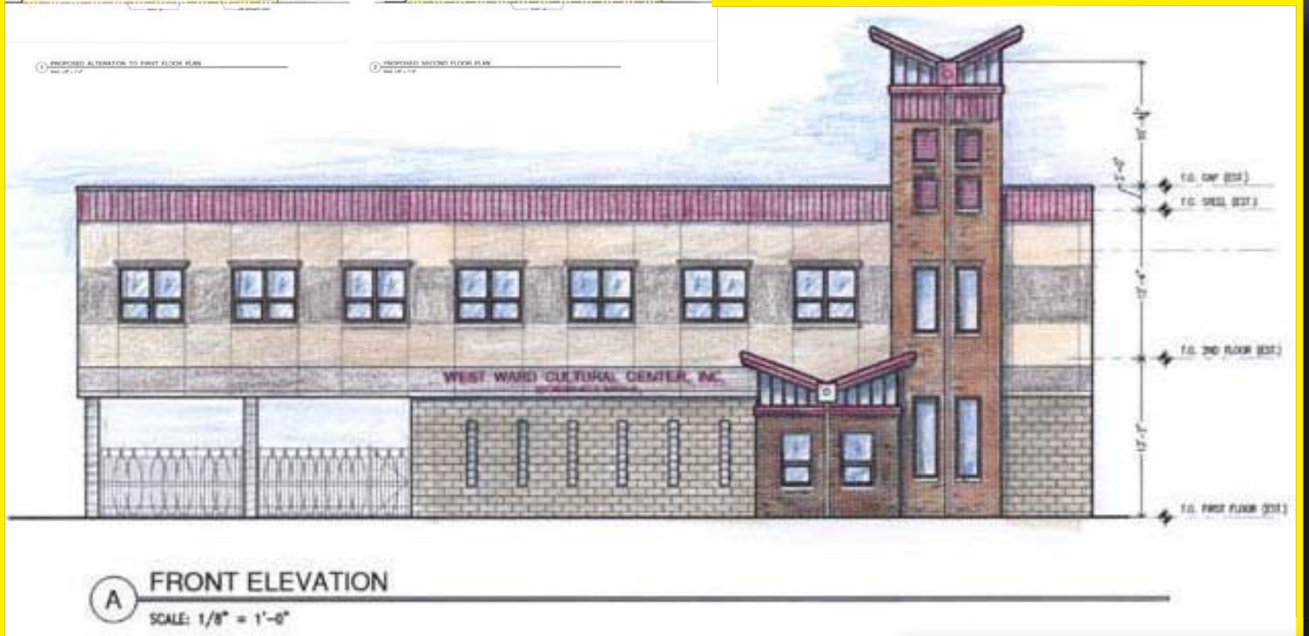
A FRONT ELEVATION SCALE: 1/8" = 1'-0"