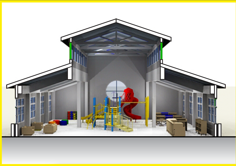
St. Joseph's Regional Medical Center